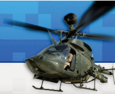
Exhibit Rules & Regulations